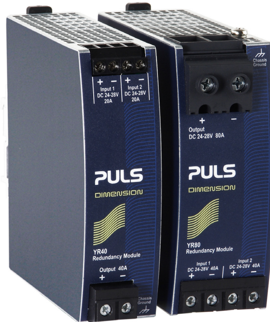
PULS YR40.241 & YR80.241 Redundancy Modules